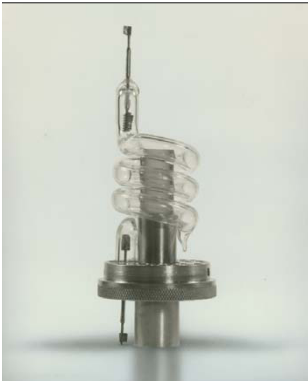
Fig 2. The first laser, without its reflective casing.