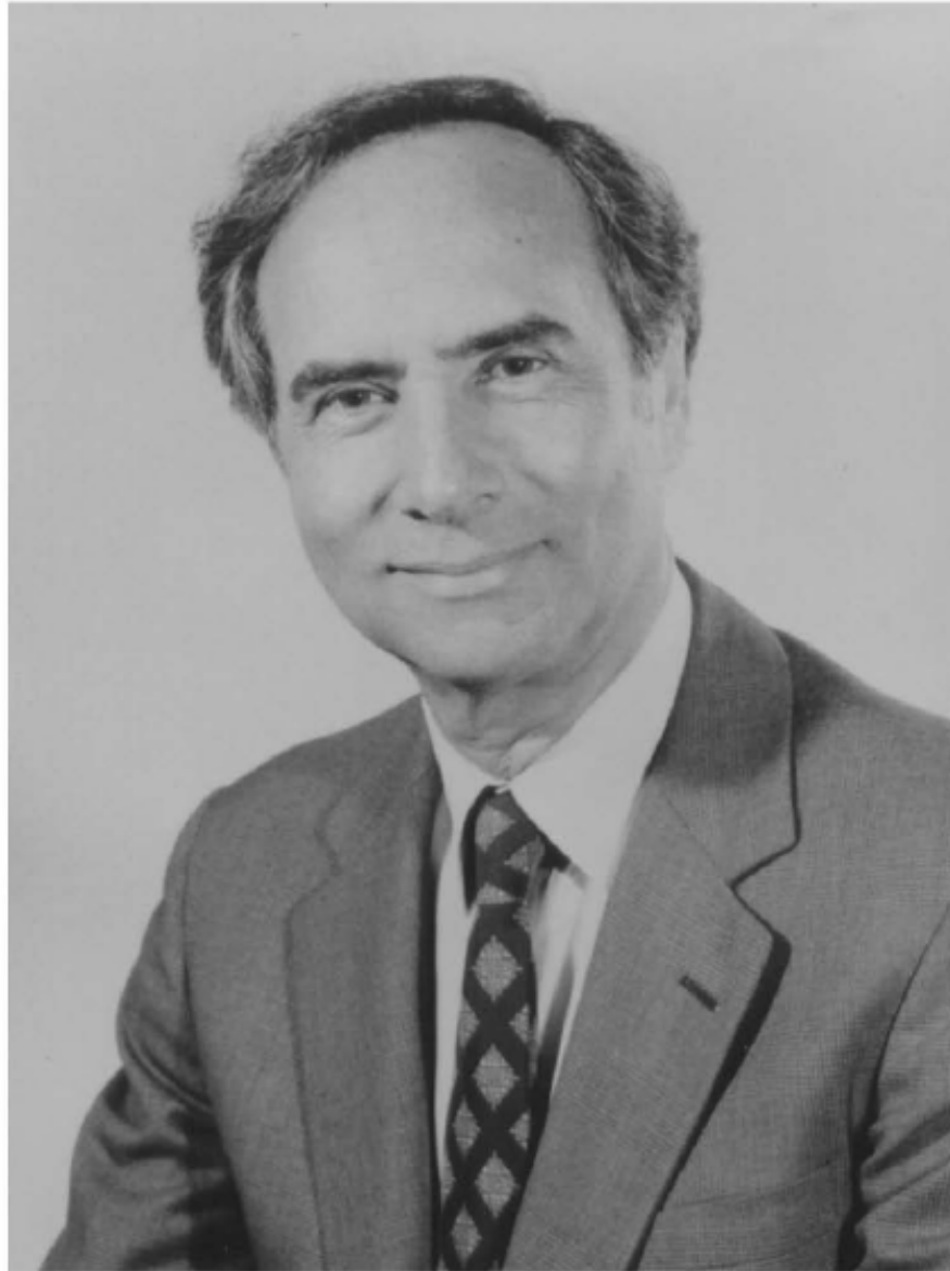
Dr. Theodore H. Maiman July 11, 1927 — May 5, 2007