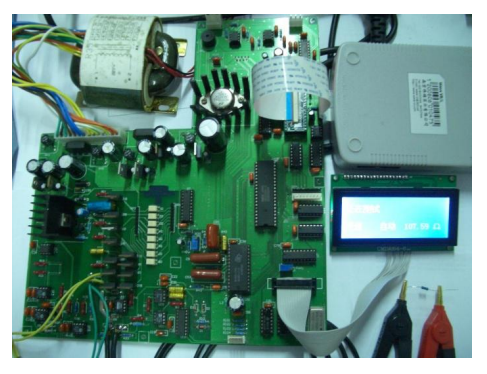
Figure 1. Intelligent DC micro-ohmmeter.

Through the implementation of training programs and curriculum system optimization, assessment reform and undergraduate tutor system and a series of initiatives, not only the students' interest in learning, self-learning spirit and innovation awareness are provoked effectively, but also the students' practical awareness is increased significantly and the student's learning attitude has changed greatly, from never concerning about the learning content to actively answer questions in the classroom and communicate with teachers about difficult problems, from seldom writing homework to complete it independently, and from conducting experiment perfunctorily to design independent innovation experiment. Therefore, school's atmosphere of academic and teaching has been improved significantly. Meanwhile, a number of courageous, innovative students take part in the proposed programs actively each year, producing a batch of outstanding prototypes with professional characteristics, such as intelligent DC micro-ohmmeter, high-precision digital perpetual calendar with automatic time service, digitally-controlled high-precision DC power supply with adjustable output voltage, photovoltaic charging controller with the function of MPPT, as shown in Figure 1 to Figure 4.