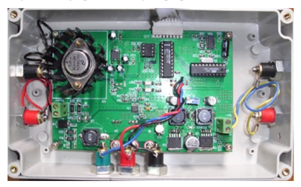
Figure 3. Digitally-controlled high-precision DC power supply. Figure 4. Photovoltaic charging controller.