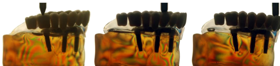
Fig. 6 Stress distribution in the models with bar clip attachment system (BC).