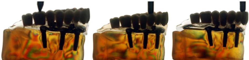
Fig. 4 Stress distribution in the models with implants splinted by bars associated with two O-rings positioned at the center of the bar (BOC).