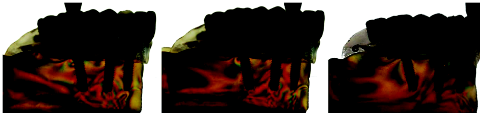
Fig. 3 Stress distribution in the models with implants splinted by bars associated with two O-rings positioned in distal cantilever (OD).