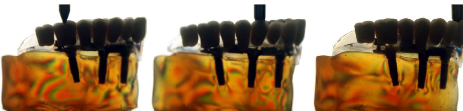
Fig. 5 Stress distribution in the models with implants splinted by bars with clips associated with two O-rings positioned in distal cantilever (BOD).