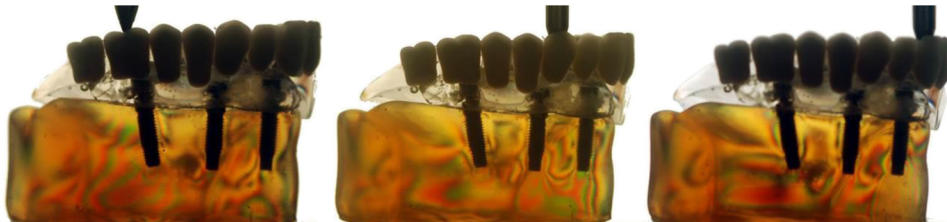
Fig. 2 Stress distribution in the models with three individualized O-rings (OR).