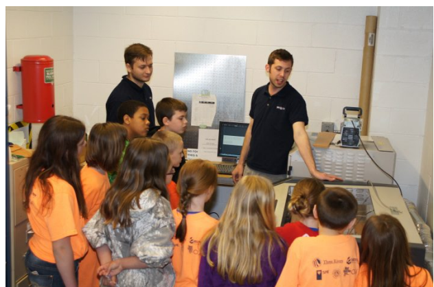
Figure 5. On left, students creating polarized light art. On right, students with SPIE student chapter students demonstrating the laser engraver.