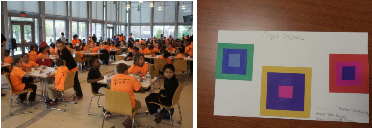
Figure 1. On the left 170 students gather for lunch at TRCC. On the right, example of student “homage to a square” artwork.

The plan for the 2013-2014 school year would include three class meetings of all 150 students (refer to Figure 1) attending each class meeting and closing with Jr Laser Camp : the first at Central Connecticut State University (CCSU), the second hosted by one of the participating elementary schools, O'Connell, and the last meeting, Jr. Laser Camp , at Three Rivers Community College. In addition, there would be lessons in the classroom in between the large gatherings and in closing a post-content survey would be provided to assess what the students had learned. Workshops at each of the class meetings would include the integration of either art or music with a science lesson. An ambitious plan, indeed.