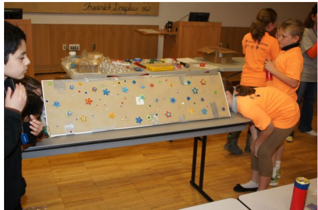
Figure 4. On left, students with kaleidoscopes. On right, students with ‘giant kaleidoscope.’