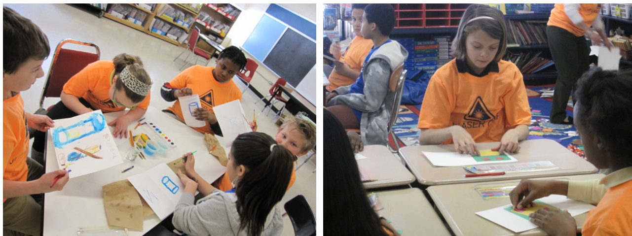
Figure 3. On left, students creating refraction artwork. On right, students creating ‘homage to a square in the style of Josef Albers.’

At this point, the students stopped their work and were given a lesson in refraction. They were shown famous artwork that demonstrated refraction and asked to look more closely at their own work. They were then given the opportunity to create “Still Life #2” in which they looked more closely at the still life and included the refraction elements.