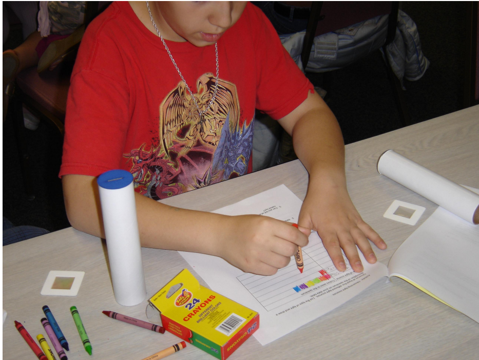
Photo 2. Exploring Light Spectra Exploration – student completing data table.

In a follow-up writing activity, students were asked to describe their favorite activity. "Kelsey" wrote "It is very hard to pick a favorite activity of the three. All of them were very fun and informative. I think the Spectroscopes was my favorite though. What I liked about Spectroscopes was how we got to build our own scopes and try different lights to see what colors make them. Plus, we got to take them home so we could use them ourselves. It was interesting how what colors you see in a light may not be what color(s) made it. Then we used a graph to record our data and see which light was the purest. The purest light has the least colors of royg biv (red, orange, yellow, green, blue, indigo, and violet) in it when viewed through the Spectroscope. The purest light we viewed was the exit sign, which had only the color red. The least pure was the fluorescent light which had all of the royg biv colors. My very favorite part about the Spectroscope was that I learned a lot of things I didn't know before. At first, I didn't even know there was anything called royg biv or that colors unseen make the light you see. I didn't know there was such a thing as a Spectroscope either. I also liked how the Spectroscope activity let us take part of what we learned home. I use my spectroscope all over my house now. The light over my stove in my kitchen is more pure than the one over my dinner table."