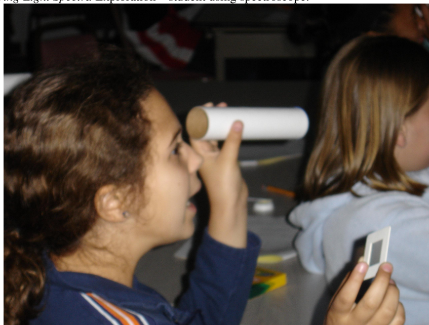
Photo 1. Exploring Light Spectra Exploration – student using spectroscope.

This lesson provided the basic ideas of light essential to the understandings of all of the Expected Performances . Students were introduced to the fundamental colors of light, the visible spectrum and wavelengths and were especially thrilled to learn about ROY G. BIV. They examined the colors radiated by several unique light sources including fluorescent bulbs, gas tubes, filtered incandescent sources, lasers and LEDs (refer to photo 1). As part of their written work, students were required to complete a data table identifying the unique spectrum of each light source (refer to photo 2). By doing this, they were able to compare the light sources and speculate how the light was produced.