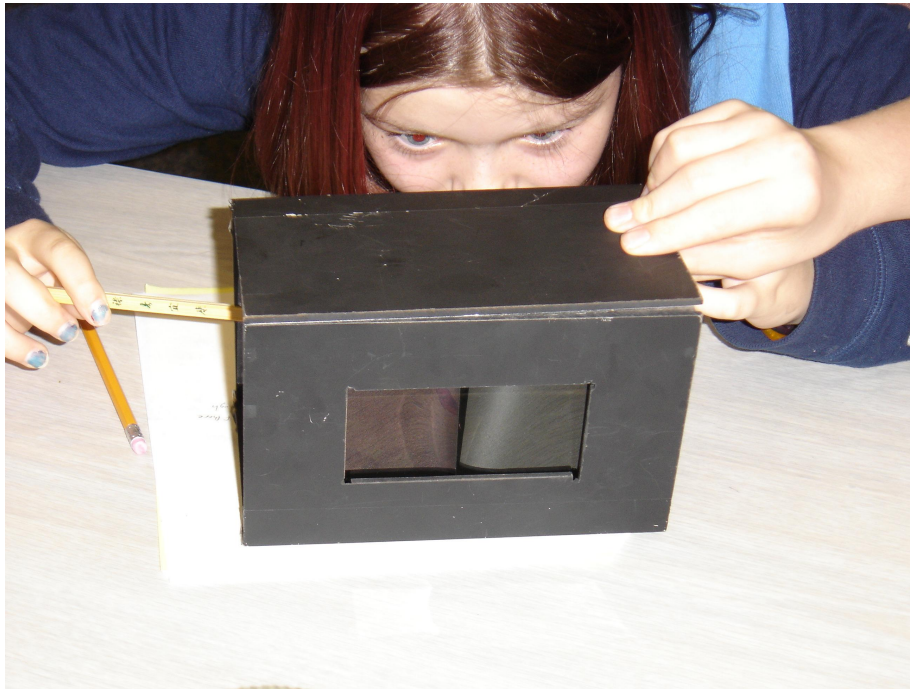
Photo 5. Exploring Polarization Exploration – student using “The Magic Box”.