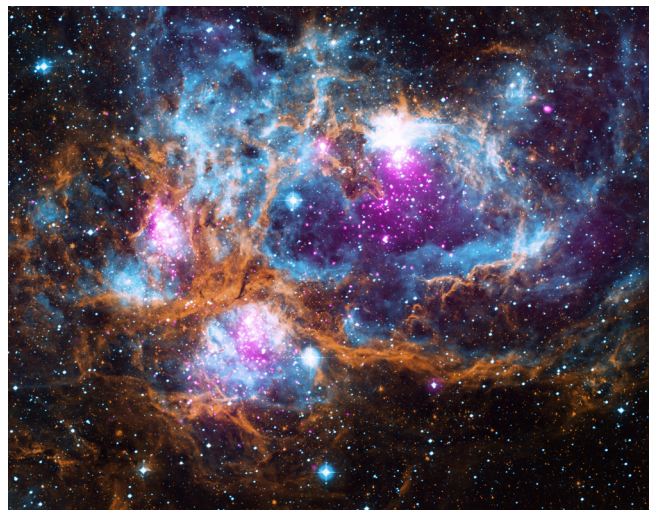
A star-formation site, nebula NGC 6357, showing the scope of photonics on a macro scale.

One of the successes of photonics has been the adoption of solar power. Around 100 GW of solar generation was added across the world in 2017. What long seemed inevitable to those aware of the potential of this environmentally friendly resource has been excruciatingly slow to